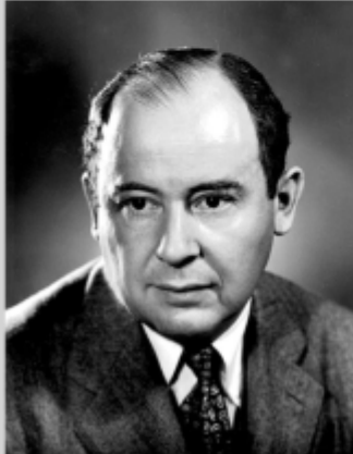
John von Neumann

John von Neumann (born János Lajos Neumann ) (Budapest, December 28, 1903 - Washington, February 8, 1957) was a Hungarian-born mathematician. In addition to his theoretical research in quantum mechanics, he became famous for laying the foundations of the digital computer.