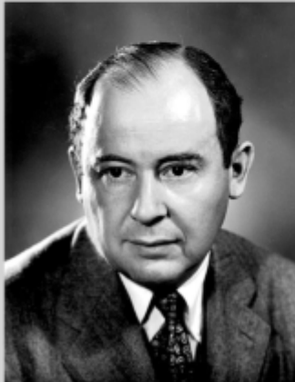
John von Neumann

John von Neumann (born János Lajos Neumann ) (Budapest, December 28, 1903 - Washington, February 8, 1957) was a Hungarian-born mathematician. In addition to his theoretical research in quantum mechanics, he became famous for laying the foundations of the digital computer.