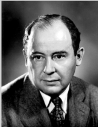
John von Neumann

John von Neumann (born János Lajos Neumann ) (Budapest, December 28, 1903 - Washington, February 8, 1957) was a Hungarian-born mathematician. In addition to his theoretical research in quantum mechanics, he became famous for laying the foundations of the digital computer.